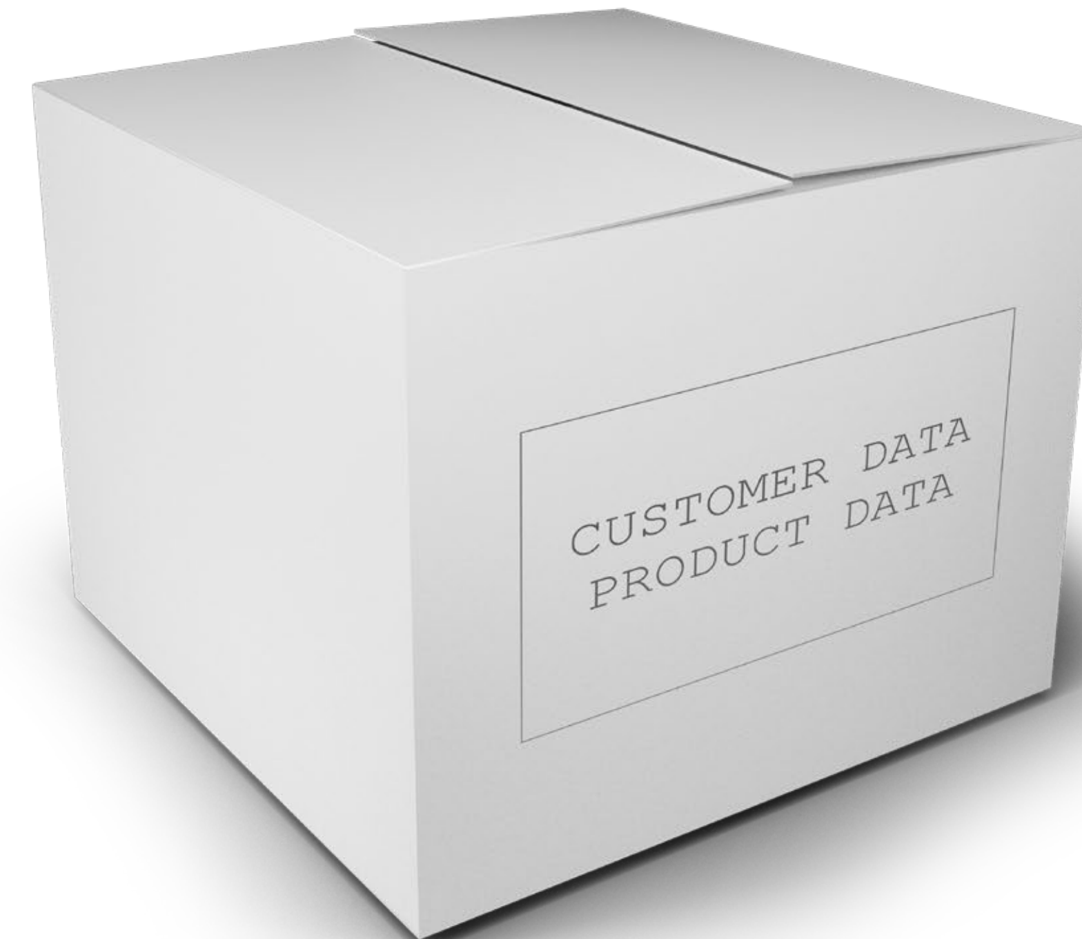
PERSONALIZED CASE ON ONE SIDE