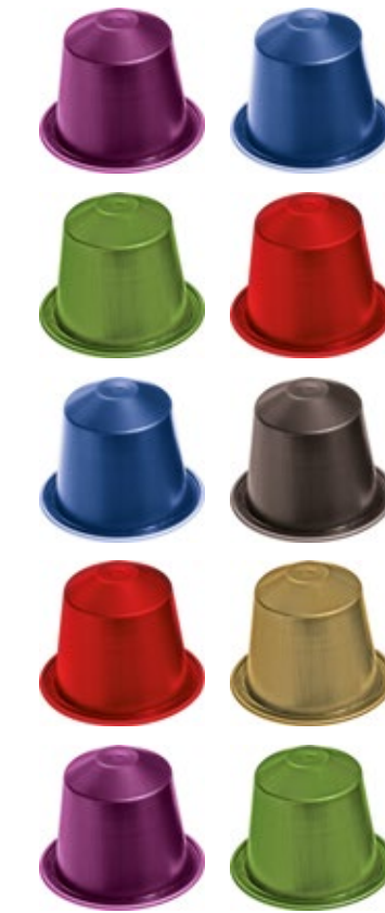
RECYCLABLE CAPSULES IN 6 COLORS